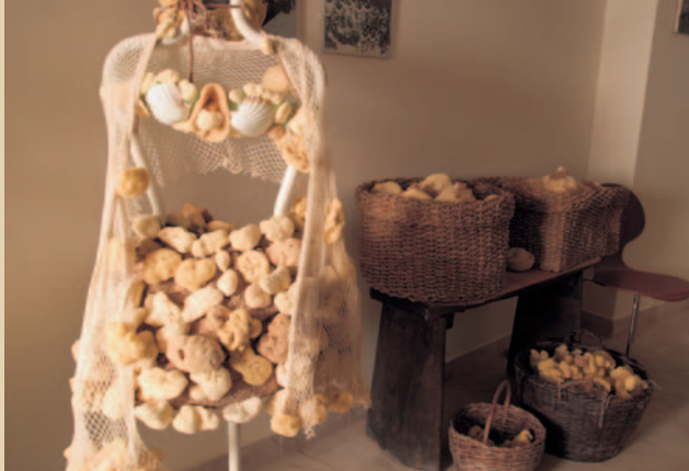
Unutrašnjost galerije - The interior of the gallery