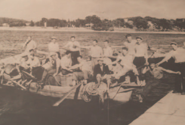
Kako je bilo nekad - As it used to be